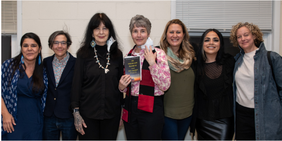
US Poet Laureate Joy Harjo with WGSS Faculty & Staff